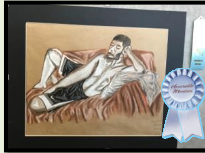
Life Drawing I