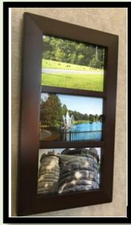
Bob's Noble Park