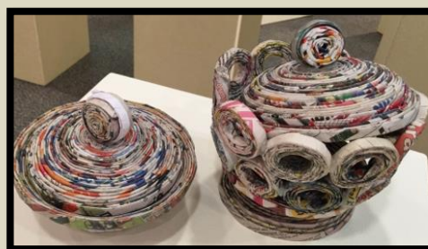
Father and Son