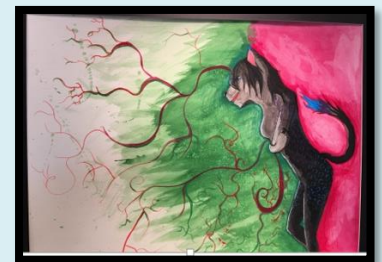
Tiger Sin II