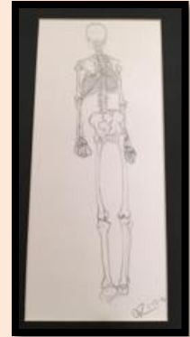
Bone Structure Study