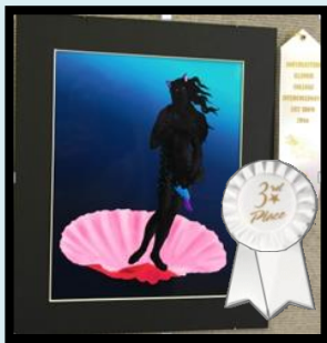
Birth of Tiger Sin