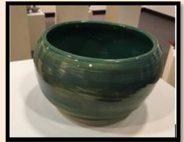
Peacock Green Bowl