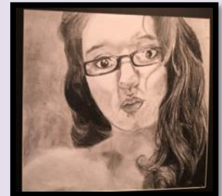
The After Party