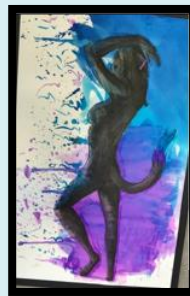
Tiger Sin I