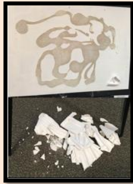
Oops! Lesson Learned...