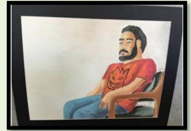
Life Drawing II