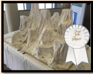
The Utopia We've Created