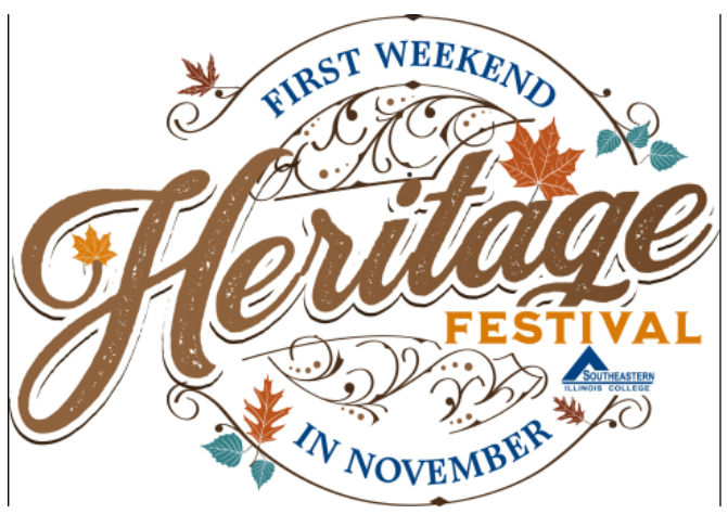
Created for the re-brand in 2021