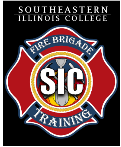
Used by Fire Brigade

Used since 2012 by Mine Rescue Competition