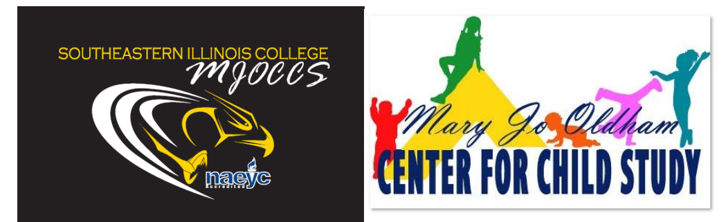
various MJOCCS logos