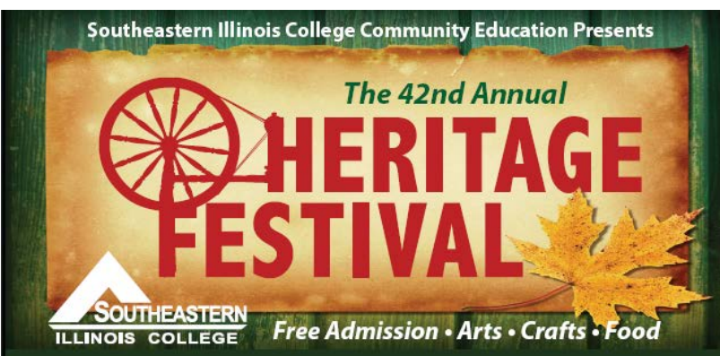
Used for many years through 2019